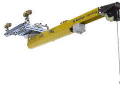
Single Lift Arms