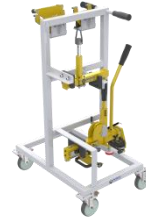
Tool Storage Systems