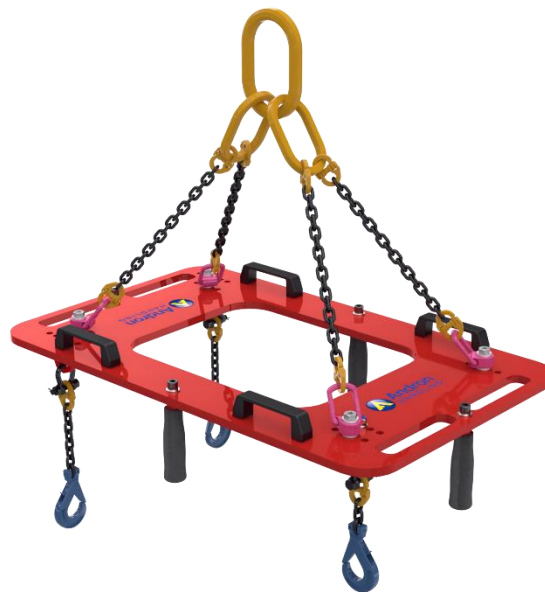
Configurable spreader plate for multi-point lifting, used in engine manufacturing facility

As with any Andron product, if our standard designs aren't exactly what you are looking for, our professional engineering team can develop bespoke designs from scratch, drawing on a huge library of previous solutions.