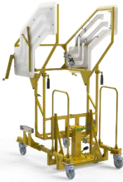
Assembly Guide Trolleys