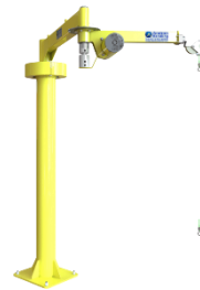
Articulating Lift Arms